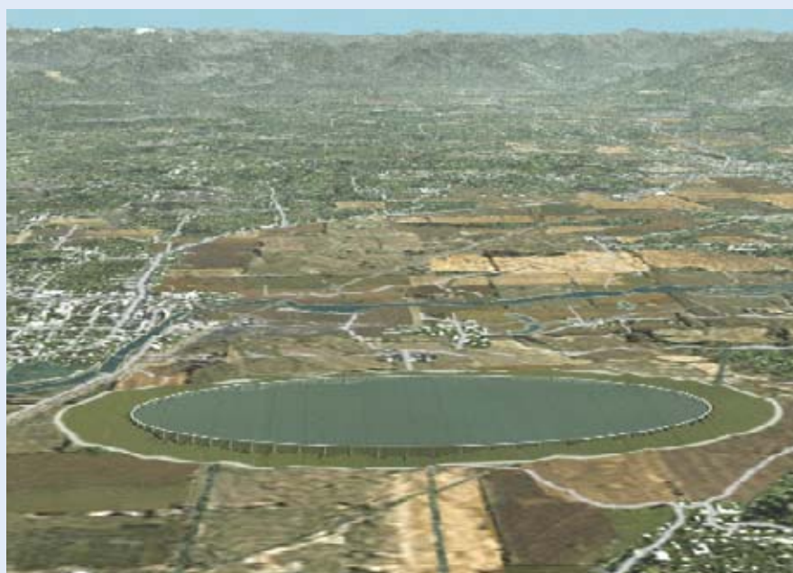
Private companies such as PowerSat Corp. have proposed erecting large rectifying antennas in order to collect microwave energy that is beamed from orbiting power stations.

This will require drastic shifts in technology and substantial research and development. One concept worth developing is the fusion-fission hybrid breeder , a potential neutron source based on already-paid-for tokamak technology that was advocated by Andrei Sakharov