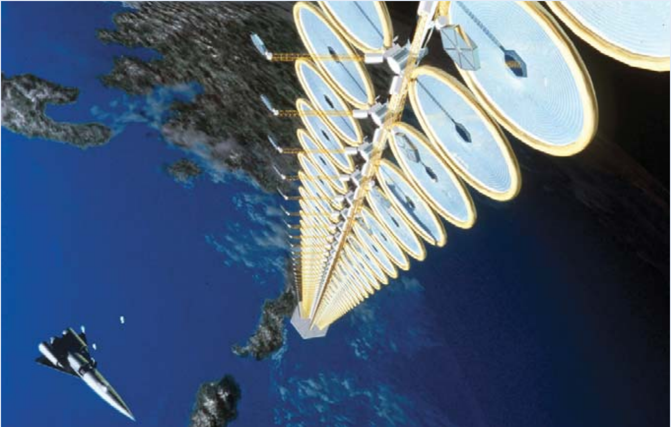
NASA engineers have looked at building giant orbiting power stations that would capture solar energy in space and beam it to the surface.

nighttime hemisphere where people want to turn on the lights. Computer-controlled load matching could balance supply and demand globally by wheeling electricity from decentralized sources to users over planetary distances. Such a global grid could evolve over time, but has key elements that must be developed and demonstrated in the near term. Before such a grid becomes fully operational, national energy laboratories could build small-scale grids to demonstrate the principle, and a regional superconducting grid could help deliver wind and solar power from the Midwest to the cities of the East Coast.