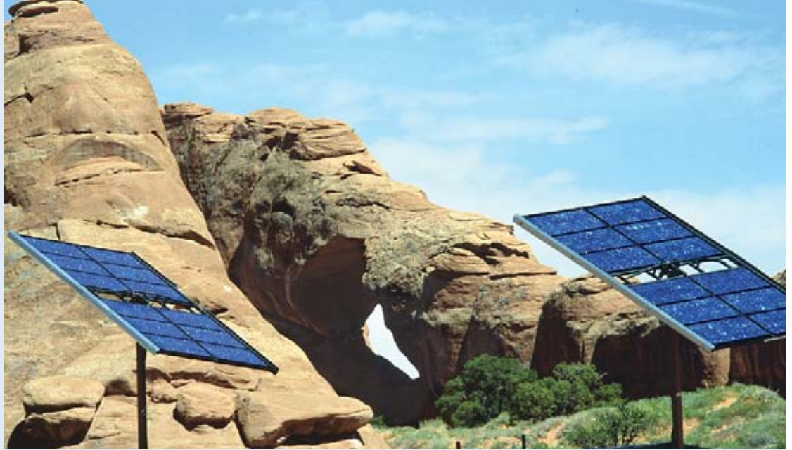
Solar cells like these could help to power a model neighborhood that incorporates energy-efficient technology. Such an experience could teach engineers how to better integrate renewable energy sources into the community.

Renewable energy sources, such as wind and solar, are generally dispersed, episodic, and low in power density. That means the keys to making renewables work on the global scale are transmission and storage of energy, and smart power conditioning. Effective hydrogen storage for transportation applications is an as-yet unsolved problem; pressure tanks, cryogenics, and metal hydrides all